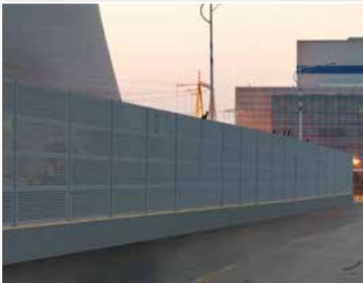
Fence with base plat option

Customised application with 1 sqm pannels to create a high security cage to protect a security door.